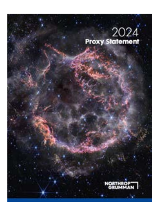
2024 Proxy Statement